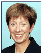
MUFFET McGRAW Head Coach 30th Year at ND St. Joseph's '77