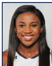
#5 JACKIE YOUNG 6-0 | G | Fr. Princeton, Ind. Princeton Community