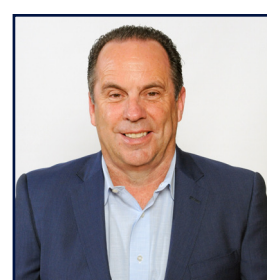
MIKE BREY HEAD COACH