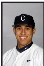
#4 GEORGE SPRINGER JUNIOR • OUTFIELDER 6-3 • 200 • R/R NEW BRITAIN, CONN.