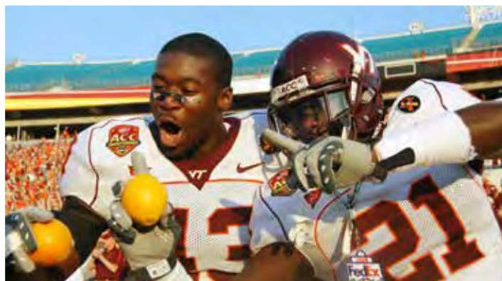
2007 ACC CHAMPIONSHIP GAME