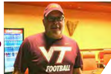
Bruce Arians pictured (left) as a Virginia Tech quarterback, and most recently as head coach of the Arizona Cardinals, proudly sporting his Hokies' swag.