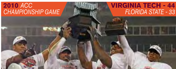
2010 ACC CHAMPIONSHIP GAME