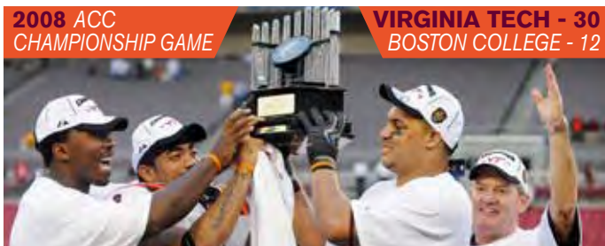
2008 ACC CHAMPIONSHIP GAME