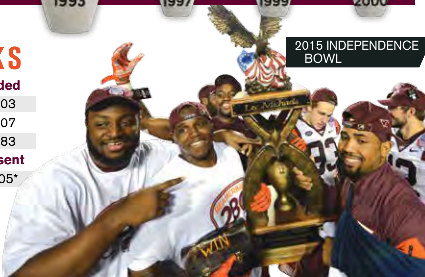
2015 INDEPENDENCE BOWL

* - Streak snapped due to bowl appearance vacated by NCAA