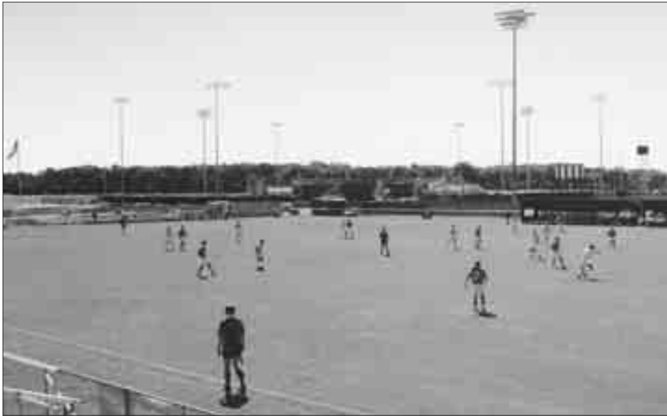
The Notre Dame men's soccer team enjoys state-of-the-art facilities like Alumni Field (top) and Loftus Center (bottom).

Championship games the last two seasons. In 2003, Notre Dame hosted the second round of the tournament, defeating UW-Milwaukee 4-1. The Irish then hosted its first-ever Sweet 16 match at Ivy Field, battling Michigan to a 1-1 tie (the Wolverines advanced 4-3 on penalty kicks).