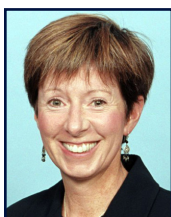
MUFFET McGRAW Head Coach 30th Year at ND St. Joseph's '77