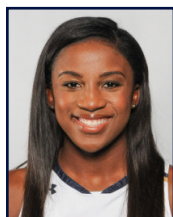
#5 JACKIE YOUNG 6-0 | G | Fr. Princeton, Ind. Princeton Community