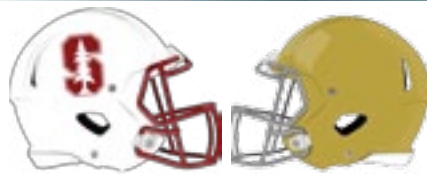
Stanford Cardinal (3-2 • 2-2 Pac-12)