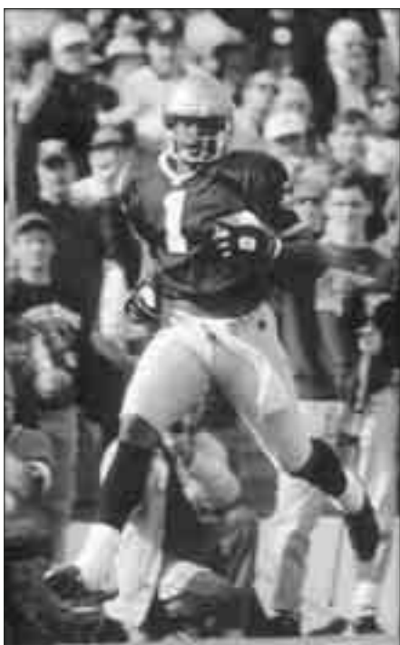
Derrick Mayes left Notre Dame in 1996 as the school record holder in receiving yards (2,512) and touchdown receptions (22).