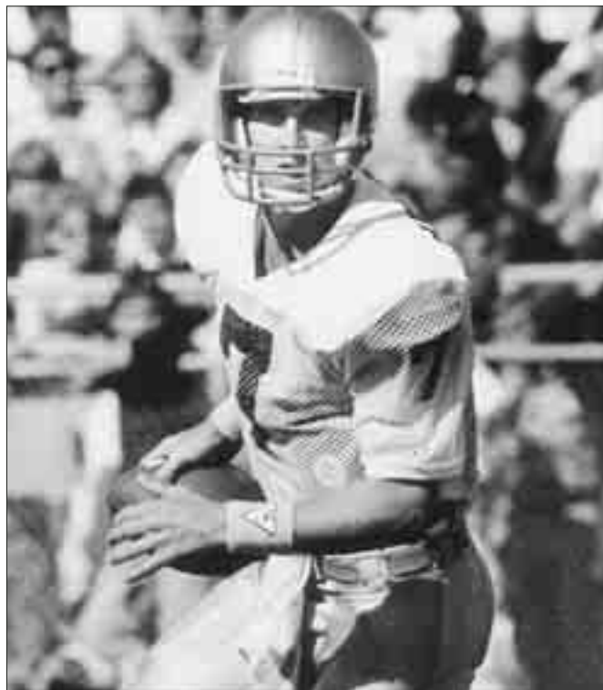
A starter in 38 regular-season games over his four seasons, Steve Beuerlein left Notre Dame as the all-time Irish leader in career total offense yards, passing yards, pass completions and pass attempts.