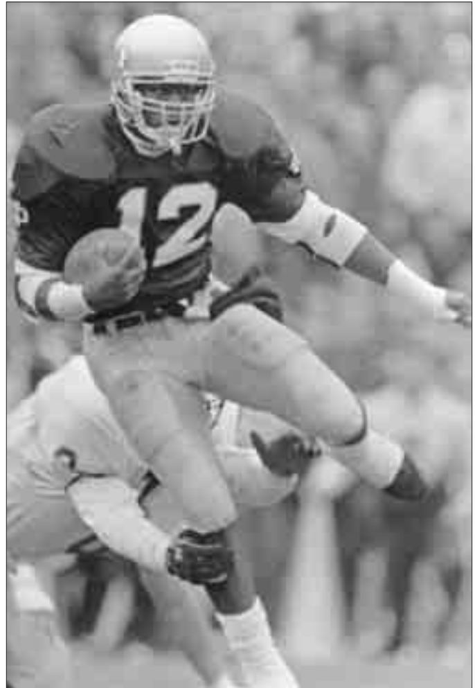
Ricky Watters, whose 81-yard punt return for a touchdown against Michigan in 1988 helped kickstart Notre Dame's national championship season, set the record a year later for longest punt return in Irish history with a 97-yarder versus SMU.