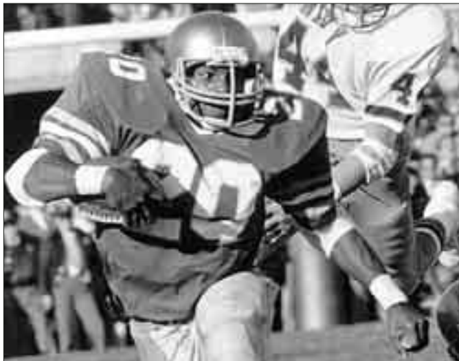
Allen Pinkett ranks first on the all-time career scoring list with 53 touchdowns and 320 points. Pinkett also holds the second- and third-highest single-season scoring figures with 110 and 108 points, respectively, in 1983 and 1984.