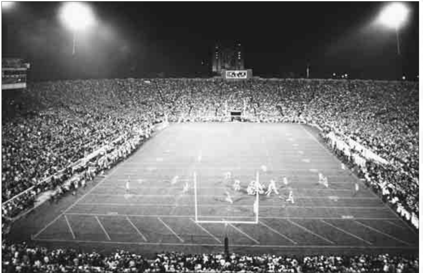
The Irish won 28 consecutive games in Notre Dame Stadium, shown here before the facility was expanded and renovated for the '97 season, between 1942 and 1950.