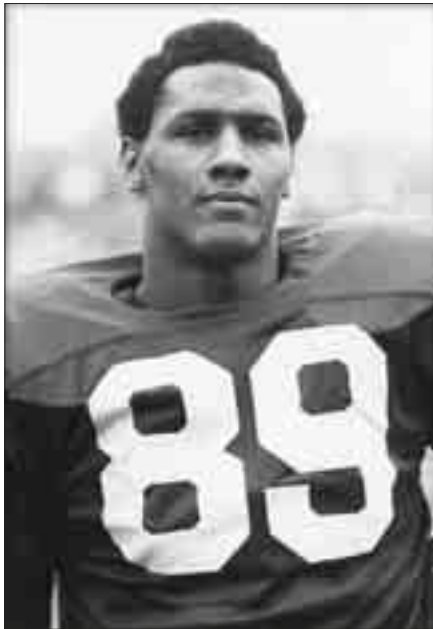
Ross Browner is the Notre Dame career leader in tackles for minus yardage with 77.