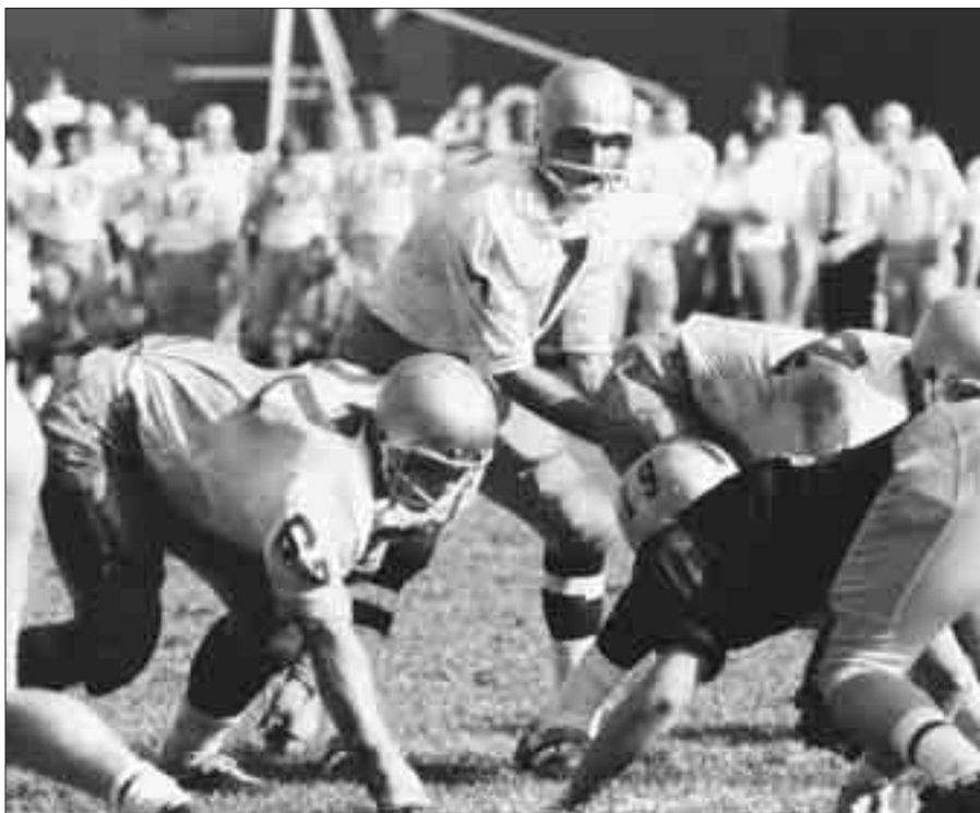
Joe Theismann is the Notre Dame single-season leader in total yardage with 2,813 yards in 1970, including a school-record 519 yards vs. USC.

Points—426, 1991 Points Per Game—55.6 (389 in 7), 1912; MR: 37.6 (376 in 10), 1968 Touchdowns—59, 1991 Touchdowns Per Game—7.9 (55 in 7), 1912; MR: 5.3 (53 in 10), 1949 Extra Points—57, 1991 Extra Point Percentage—100.0 (41 of 41) 1990, (36 of 36) 1987, (34 of 34) 1972 Two-Point Conversions Attempts—12, 1964 Two-Point Conversions—3, 1971, 1970, 1965, 1958, 1999