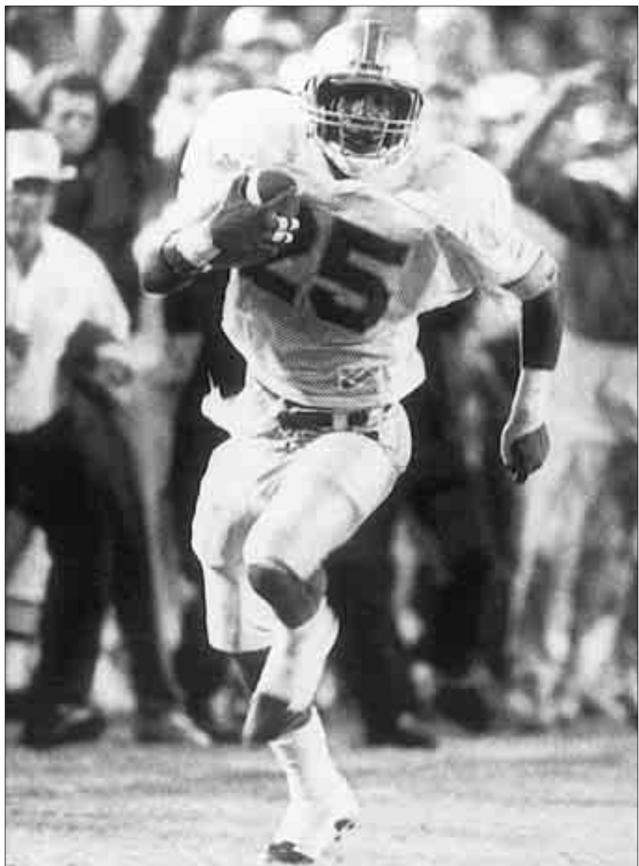
In addition to leading the nation in kickoff returns in 1988, Raghib Ismail became the only player in NCAA history to return two kickoffs for touchdowns in two different games, doing that against Rice in 1988 and Michigan in 1989.