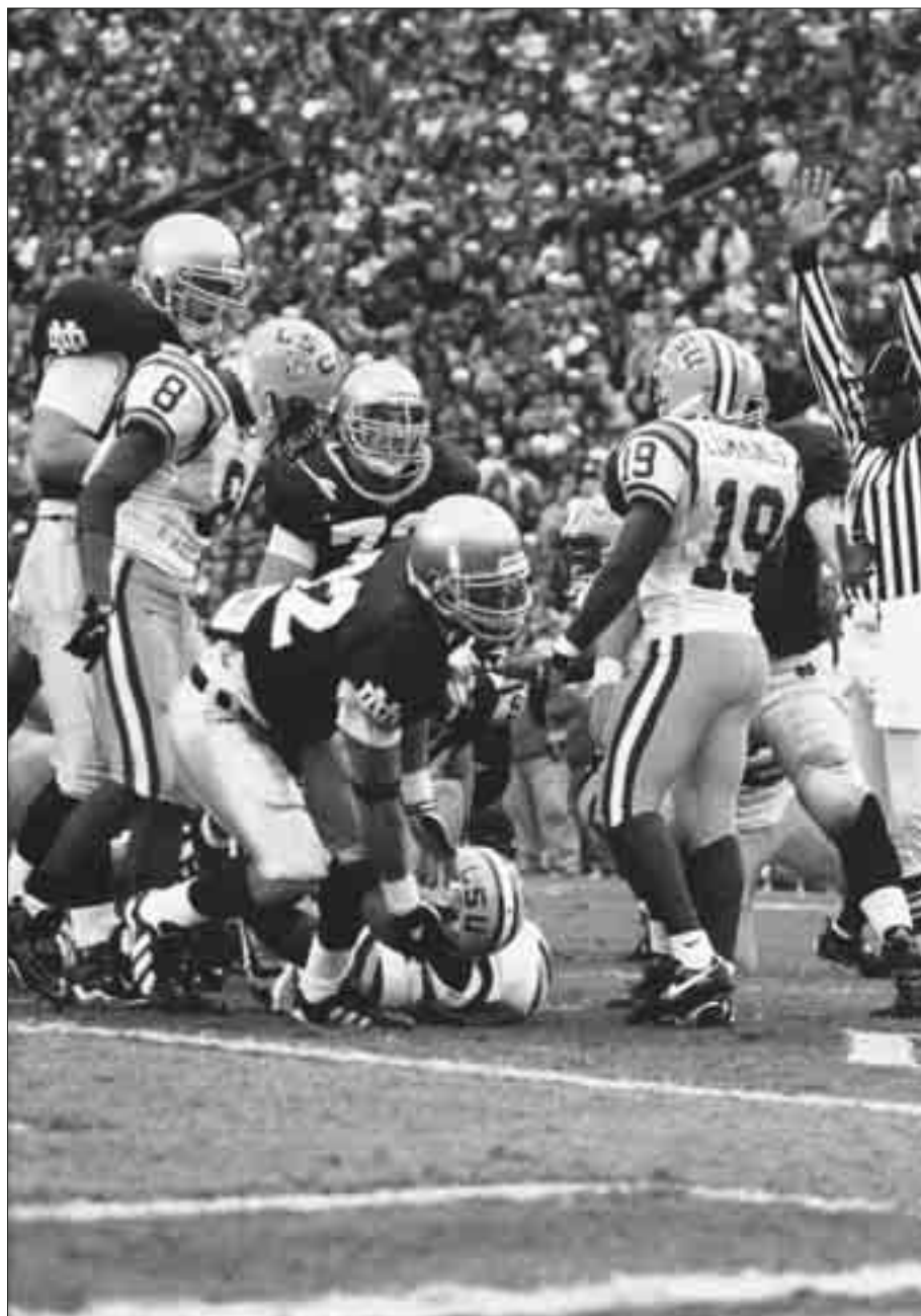
Notre Dame's 1997 win in Baton Rouge against LSU set a single-game Irish record as the first time in history Notre Dame played without either a penalty or a turnover.

Fewest Total Offense Attempts Allowed Per Game—37.1, 1924; MR: 46.1, 1937 Fewest Total Offense Yards—651, 1924; MR: 1275, 1946 Fewest Total Offense Yards Allowed Per Game—72.3 (651 in 9), 1924; MR: 141.7 (1275 in 9), 1946 Fewest Total Offense Yards Per Attempt—1.8 (468 for 843), 1921; MR: 2.7 (481 for 1283), 1941