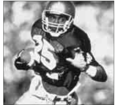
Raghieb "Rocket" Ismail is one of the greatest kick returners in Notre Dame history after he led the Irish in kick return average from 1988-90.