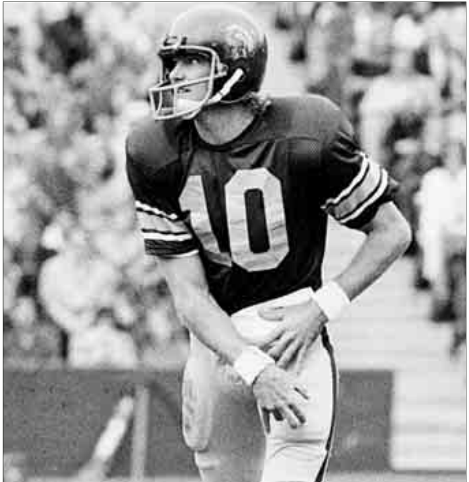
Former USC quarterback Pat Haden is one of seven players who hold the opponent touchdown pass record after he threw four against the Irish in 1974. Haden currently serves as the television analyst for all Notre Dame home games on NBC.

First Downs—34 by Stanford, 1997 First Downs by Rushing—27 by Air Force, 1991 First Downs by Passing—23 by Miami, 1988 Rushing Attempts—76 by Nebraska, 1922 Rushing Yards—411 by Pittsburgh (50 attempts), 1975; by Michigan State (60 attempts), 1962 Pass Attempts—68 by Stanford (completed 39), 1989 Pass Completions—39 by Stanford (attempted 68), 1989 Passing Yards—425 by USC (32 of 46), 2002 Touchdown Passes—4 by USC, 2003, USC, 2002; Ohio State, 1995; Texas, 1995; Boston College, 1993; Miami, 1988; USC, 1974; Duke, 1961; Purdue, 1954; SMU, 1951 Total Offense Attempts—95 by Stanford (421 yards), 1994 Total Offense Yards—610 by USC (84 attempts), 2002 Points—59 by Army, 1944 Touchdowns—10 by Wisconsin, 1904