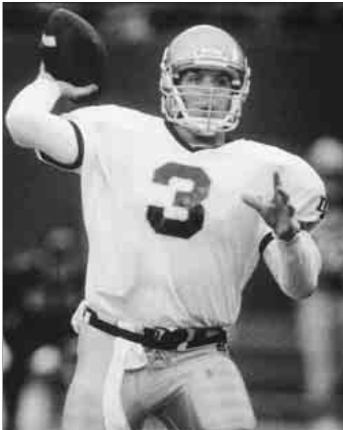
Rick Mirer's abilities as both a passer and a runner enabled him to total 6,691 yards of total offense in his career, a figure that stands second in the Irish record book.