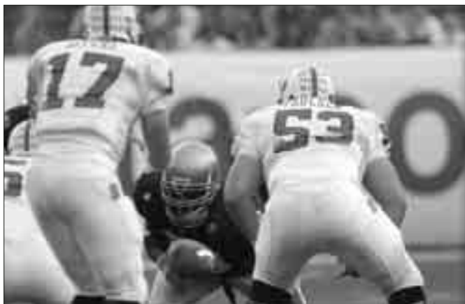
North Carolina State quarterback Philip Rivers had a good day against the Irish at the 2003 Gator Bowl completing 23 passes for 228 yards.