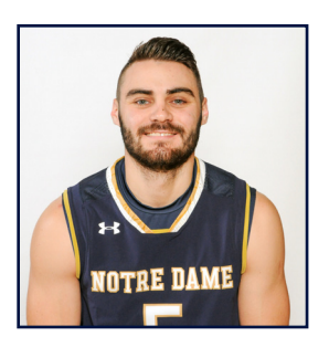
JR | G | 6-1 | 178 BRIDGEWATER, NJ