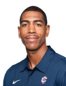
Kevin Ollie Assistant Coach First Year At UConn