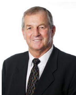
Jim Calhoun Head Coach 25th Year At UConn