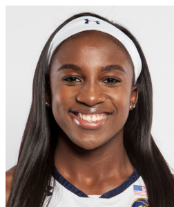
#5 Jackie Young So. // G // 6-0 Princeton, Ind. Princeton Community