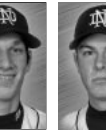
#45 Jeff Samardzija Fr., RHP • Valparaiso, IN