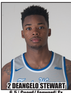
6-5 | Guard/ Forward| Sr. Detroit, Mich. Alabama State