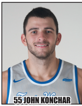
6-5 | Guard | R-So. West Chicago, III. West Chicago