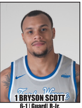
6-1 | Guard| R-Jr. Fort Wayne, Ind. Purdue