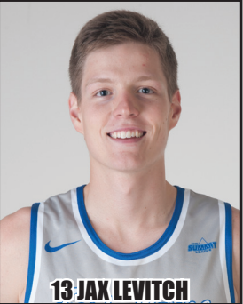
6-7 | Guard | Fr. Louisville, Kent. Elev8 Academy