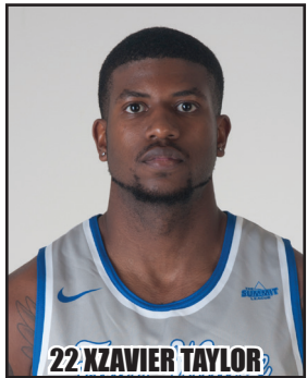
6-9 | Forward | R-Jr. Chicago, III. Bradley