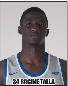
6-9 | Forward | R-So. Dakar, Senegal East Central (Miss.) CC