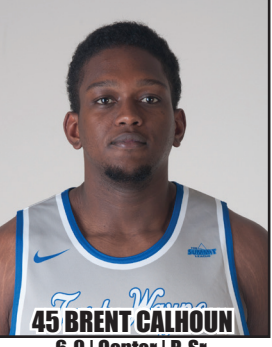
6-9 | Center | R-Sr. Indianapolis, Ind. Warren Central