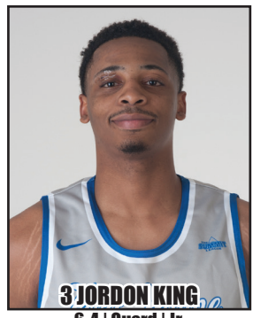
6-4 | Guard | Jr. Seattle, Wash. North Idaho