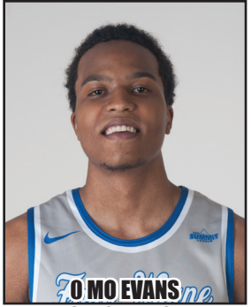
6-1 | Guard | Sr. Indianapolis, Ind. Cathedral HS