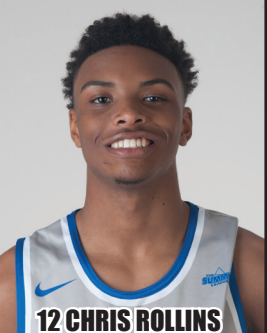
6-0 | Guard | Fr. Detroit, Mich. East English Village Prep