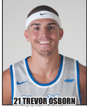
6-0 | Guard | Jr. Fort Wayne, Ind. Homestead HS