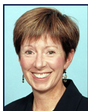
MUFFET McGRAW Head Coach 30th Year at ND St. Joseph's '77