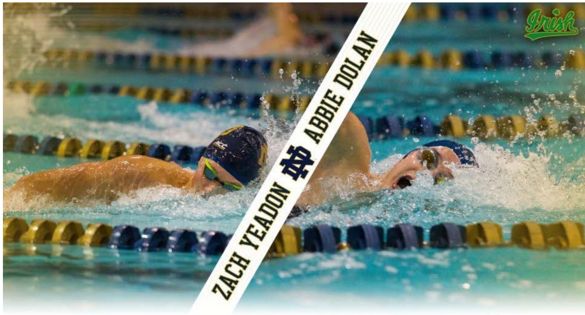
Irish duo named ACC and national men's and women's Swimmers of the Week