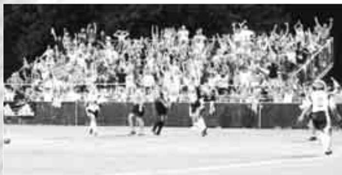
The Notre Dame women's soccer teams have played at Alumni Field since 1990. Located in the southeast corner of campus, it is one of the finest collegiate soccer venues in the Midwest with a seating capacity of 2,500. A press box was added in 1996.