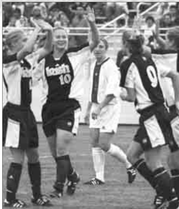
Notre Dame's top-ranked team scored first in 22 of 25 games during the 2000 season while trailing for a total of just 35 minutes.

Aug. 29 - Notre Dame opens the season minus six injured players but responds with its second-highest scoring game of the Randy