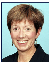
MUFFET McGRAW Head Coach 30th Year at ND St. Joseph's '77