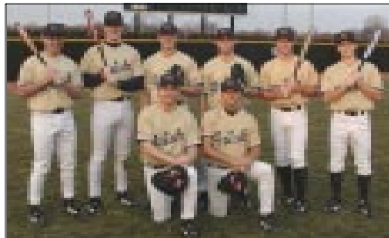
See Saturday's game program (and www.und.com ) for a feature story on the 2002 senior class.