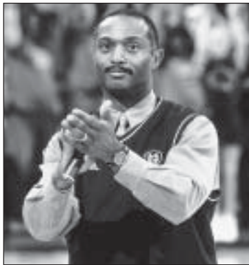
Head coach Tyrone Willingham and the Irish open spring practice on April 6 at 3:15 p.m.

First-year Irish head coach Tyrone Willingham announced the complete schedule of 15 workout dates as follows with spring practice concluding April 27 with the annual Blue-Gold contest in Notre Dame Stadium.