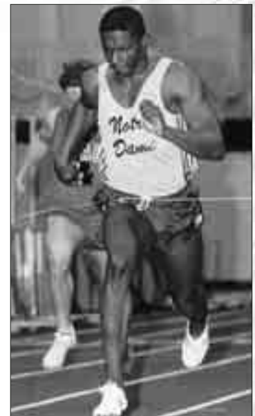
Irish football flanker Tim Brown (above) held the Notre Dame 55-meter record until fellow gridiron star Raghieb Ismail broke the record in 1991. Brown won the Heisman Trophy for his football exploits in 1987.

The Meyo track has established itself as one of the fastest surfaces in the nation and welcomes a number of high-class athletes in a 'last chance' meet (the Alex Wilson Invitational) who are attempting to qualify for the NCAA Indoor Championship. The Meyo Invitational, which features the 'Meyo Mile' (a special race that features many of the top milers in the nation) and the Alex Wilson Invitational are fixtures on the Notre Dame track and field indoor schedule each season.