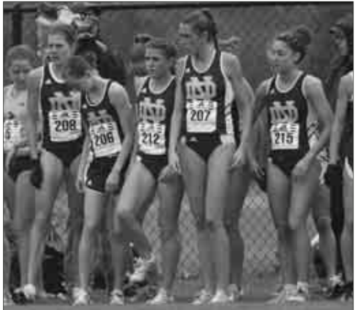
The 2003 women's team gets ready for the start of last season's Notre Dame Invitational. The Irish brought home the team title for the third consecutive season.