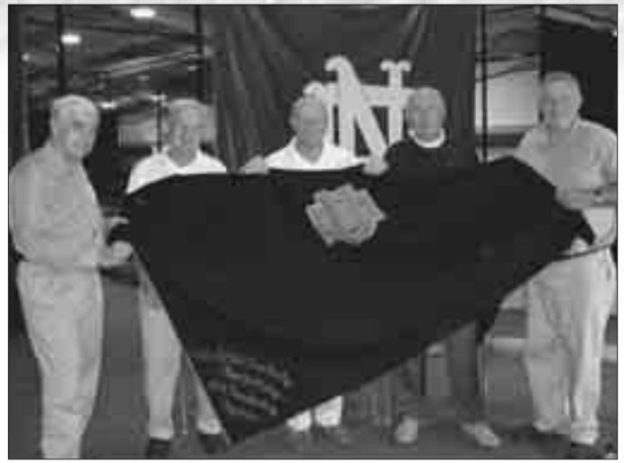
The 1957 national champion Irish cross country team reunited on campus in the fall of 2001 and was honored at the football game against Michigan State on Sept. 22. Member of that same '57 championship won the first-ever Notre Dame Invitational title in 1956.