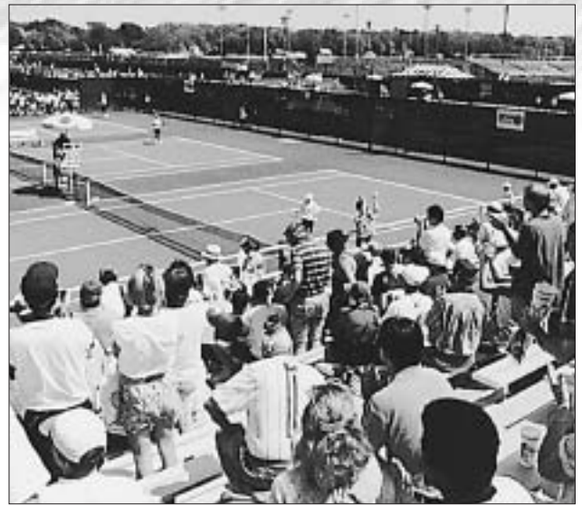
The Courtney Tennis Center has played host to NCAA Championship action 10 times, including serving as the national site of the 1998 NCAA Championships.

Since opening in 1967, the Courtney Tennis Center has undergone a variety of improvements. Most recently, 14 of the courts were newly resurfaced during the summer of 2003 and the facility was reoriented in the winter of 2004 as construction began on the neighboring Guglielmino Family Athletics Center. That undertaking saw the con-