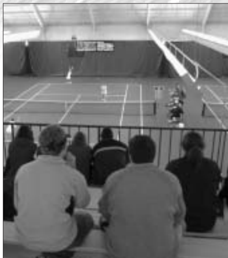
The Irish faithful showed up in force for the 2003 Ace for the Cure, in which Notre Dame upset #13 Texas 5-2 in the Eck Tennis Pavilion.

In addition, the Eck Tennis Pavilion has three times welcomed the Intercollegiate Tennis Association's Midwest Region Indoor Championships and six times helped play host to the Midwestern Collegiate Conference Championship. After its completion, the facility played host to the Eck Classic for 15 consecutive years and also has provided additional courts for the men's Tom Fallon Invitational.