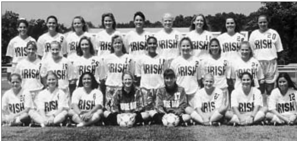
Notre Dame's 1995 NCAA championship team, which included six players who would earn All-America honors during their Irish careers (see pp. 108-111):