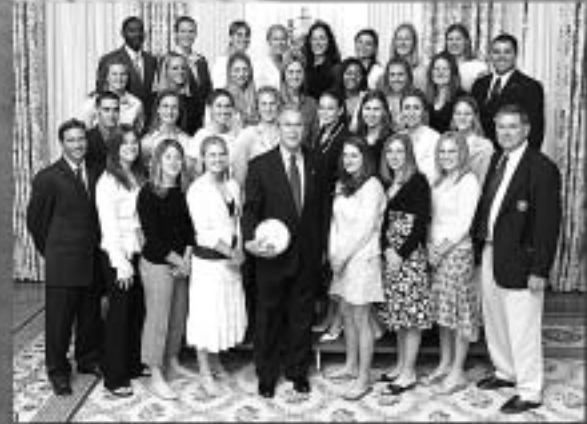
A special White House ceremony in May of 2005 capped the memorable year for the Irish.