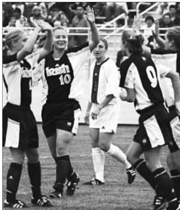
Notre Dame's top-ranked team scored first in 22 of 25 games during the 2000 season while trailing for a total of just 35 minutes.

Aug. 29 – Notre Dame opens the season minus six injured players but responds with its second-highest scoring game of the Randy