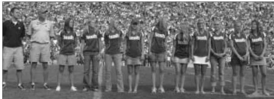
The Notre Dame women's tennis team was honored for its accomplishments during the 2004-05 season - which included winning a sixth BIG EAST Conference championship and earning its 12th NCAA tournament bid in the last 13 years - at the Irish football game against Michigan State in front of a crowd of 80,795.

Printing by Ave Maria Press in Notre Dame, Ind.