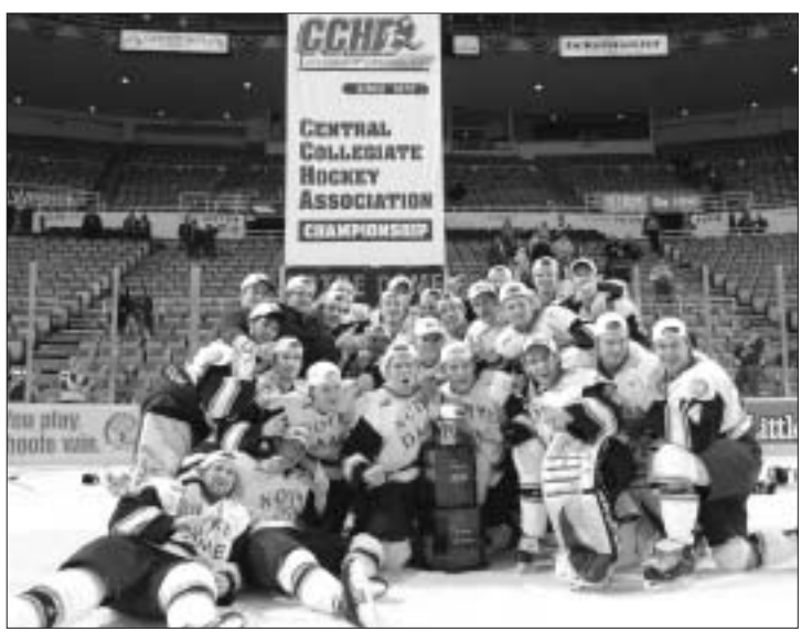
The Notre Dame hockey team won its first-ever CCHA regular-season and postseason tournament titles during 2006-07. The Irish (32-7-3) were ranked number one in the country for seven straight weeks from Feb. 5 through March 23.

tutions for maintaining athletic programs that seek to achieve success in many sports, men's both women's. Begun in 1993-94 for Division I by NACDA and USA Today, the program was expanded in 1995-96 to include Divisions II, III, and the NAIA. The scoring format – which has has undergone yearly minor adjustments - awards the overall champion to institutions that records the highest number of points in their division's Directors' Cup standings.