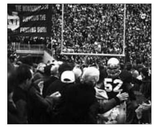
Monogram Club dues-paying members annually greet the Notre Dame football team as it takes the field prior to the final home game.

gram winners in attendance, who form the pregame tunnel as the lrish team takes the field) \,