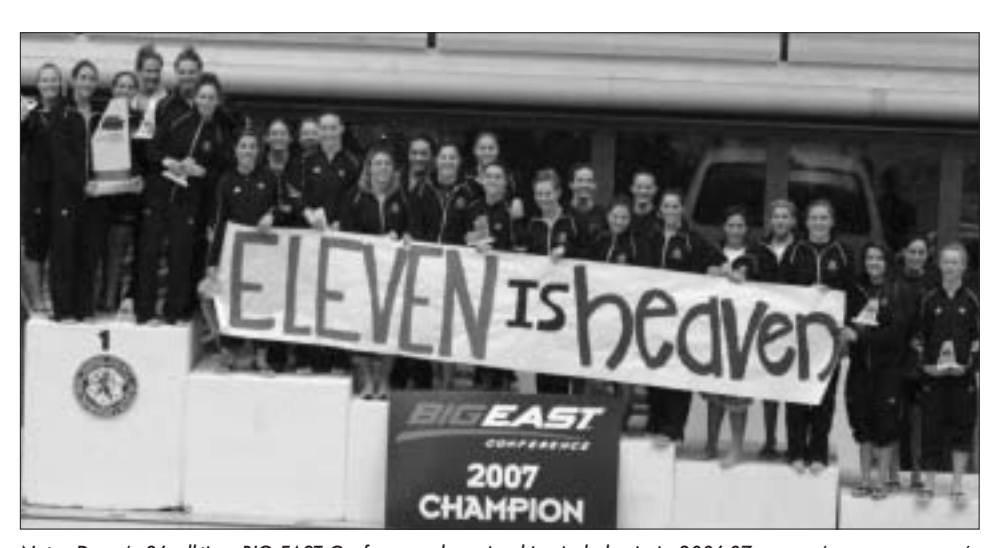
Notre Dame's 86 all-time BIG EAST Conference championships include six in 2006-07: women's societ, women's swimming and diving, men's indoor track and field, men's tennis, women's rowing and women's outdoor track and field.

While the membership has both increased and changed, the focus of the BIG EAST has not wavered. The conference reflects a tradition of broad-based programs, led by administrators and coaches who place a constant emphasis on academic integrity. Its student-athletes own significantly high graduation rates and their record of scholastic achievement notably shows a balance between intercollegiate athletics and academics