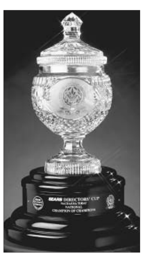
Notre Dame placed 22nd in the 2006-07 NACDA Directors' Cup competition, marking its ninth straight top-25 finish in the annual all-sports rankings.