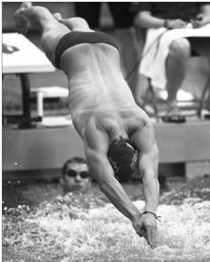
A nationally-ranked incoming recruiting class could provide Notre Dame with the depth it needs to make a run at a conference title and NCAA Championship bid.