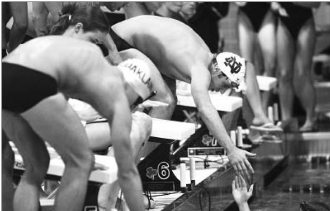
Seven school record holders on the swimming side and a pair of record-holding divers return for the 2007-08 season with the hopes of leading the Irish to their third BIG EAST crown since 2005.