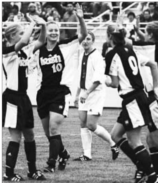
Notre Dame's top-ranked team scored first in 22 of 25 games during the 2000 season while trailing for a total of only 35 minutes.