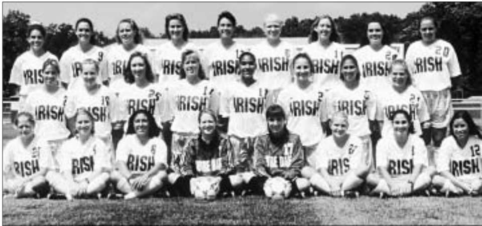
Notre Dame's 1995 NCAA championship team, which included six players who would earn All-America honors during their Irish careers (see pp. 109-113):