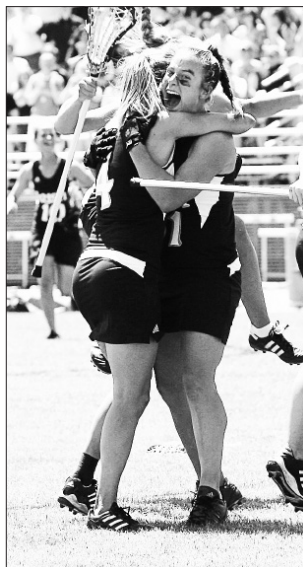
Notre Dame's first-ever win against Georgetown on May 20, 2006 sent the Irish to the 2006 NCAA Finals in Boston, Mass.