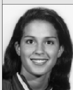
#7 Senior Richardson, TX 22 GP/ 16 GS, 1G-3A