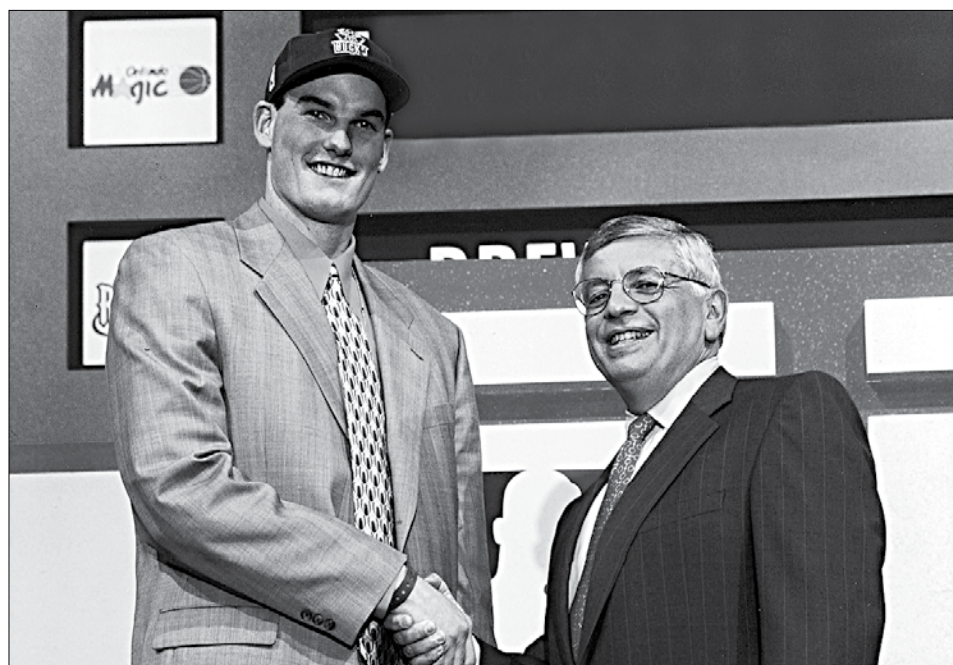
Pat Garrity was a first-round draft pick of the Milwaukee Bucks in 1998 and played his rookie year with the Phoenix Suns.

Number in parentheses next to first-round pick indicates overall draft position when available.