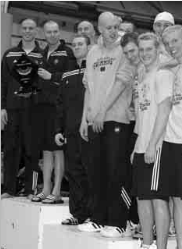
Notre Dame scored 584 points in the 2004 BIG EAST Championships, its highest-ever total in the meet, en route to a runner-up result which saw them outscored by perennial-champion Pittsburgh by just 46 points in the swimming events.

The BIG EAST meet was the culmination of a season that saw the Irish excel in championship meets. They began the campaign with an eye-opening performance at the first-ever Dennis Stark Relays (renamed in honor of the