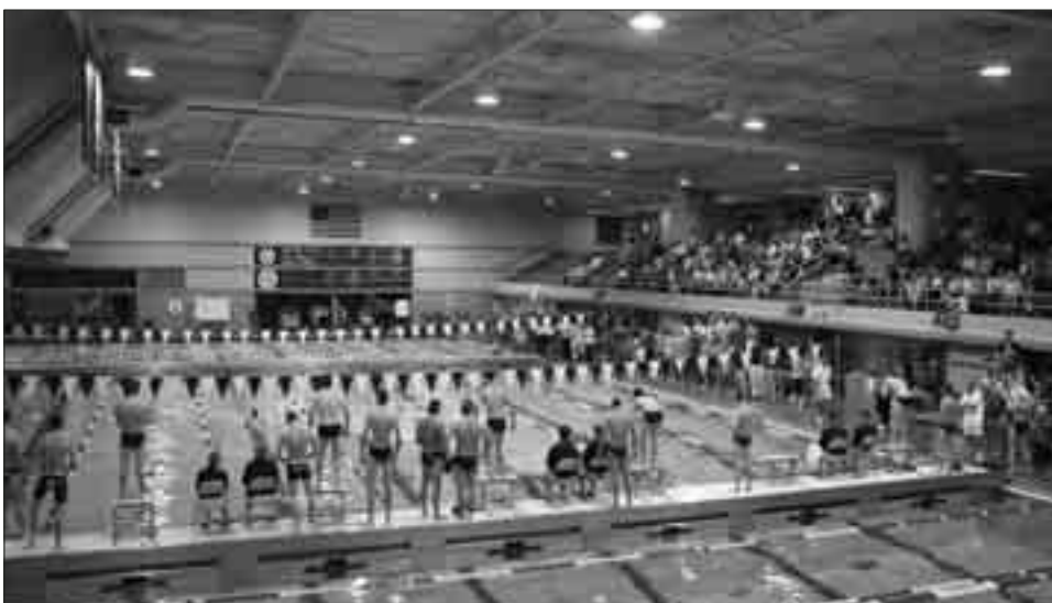
Rolfs Aquatic Center is home to Notre Dame's men's and women's swimming and diving teams. The pool has two moveable bulkheads that allow the Irish the opportunity to train on either a long or short course.

Support functions housed in the center of the facility just below the spectator seating include men's and women's locker rooms, men's and