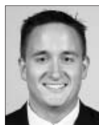
Sean Carroll Sports Information