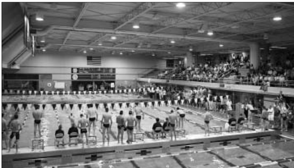
Rolfs Aquatic Center is home to Notre Dame's men's and women's swimming and diving teams. The pool has two moveable bulkheads that allow the Irish the opportunity to train on either a long or short course.