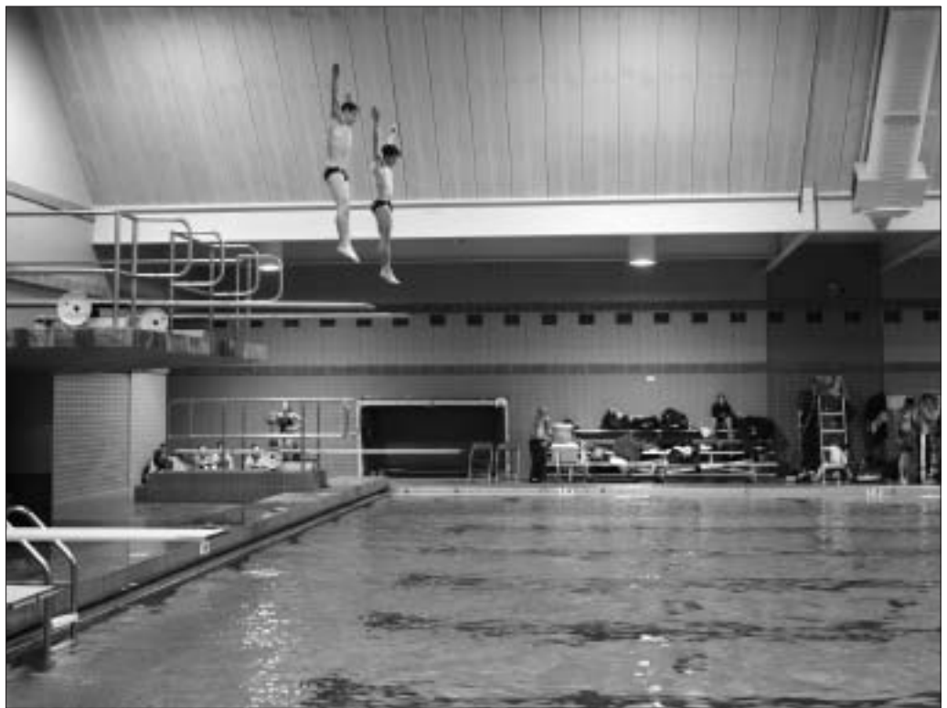
Equipment necessary for the latest diving training techniques, including a trampoline, is located in the diving area. The Rolfs Aquatic Center diving well contains two one-meter boards and two three-meter boards.

Support functions housed in the center of the facility just below the spectator seating include men's and women's locker rooms, men's and women's varsity locker rooms, and men's and women's staff locker rooms. Offices for the Notre Dame swimming staff, aquatics directors, and lifeguards are deck-