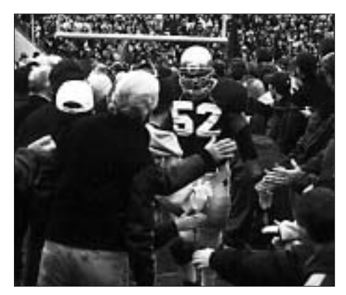
Monogram Club dues-paying members annually greet the Notre Dame football team as it takes the field prior to the final home game.