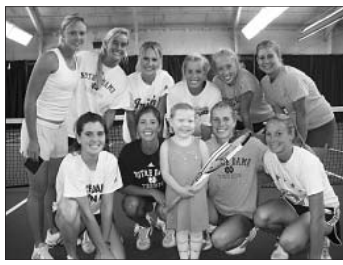
assisting The women's tennis team participates in the Fight for Life program that links teams with young cancer patients.

the Freshmen Student-Athlete and Parent Orientation; developing a SAAC service project (Shoebox Drive for the homeless); providing a team community service award; having better access to a sports psychologist; and adding a member to SAAC who represents international student-athletes. SAAC's monthly meetings also include discussions on important issues such as NCAA legislation, career opportunities, eating disorders, alcohol and supplement usage, and technological issues involving sites such as Facebook and Myspace.