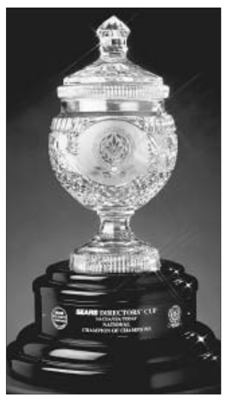
Notre Dame placed sixth in the 2005-06 NACDA Directors' Cup competition, its highest finish in the 13-year history of the Directors' Cup.

The Directors' Cup competition honors institutions for maintaining athletic programs that seek to achieve success in many sports, both men's and women's. Begun in 1993-94 for Division I by NACDA and USA Today, the program was expanded in 1995-96 to include Divisions II. III. and the NAIA. Each institution is awarded points in a pre-determined number of sports for men and women (10 each in Division I). The overall champion is the institution that records the highest number of points their division's in Directors Cup standings.