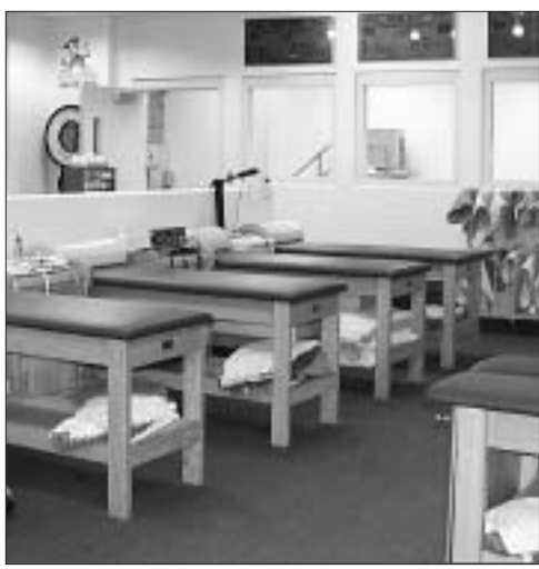
from the team of athletic trainers and physicians.

three state-of-the-art facilities. The 2005-06 academic year was a time of key growth and expansion for Notre Dame's athletic training operation, in keeping up with the changing demands Irish athletics receive the finest in sports medicine care of college athletics.