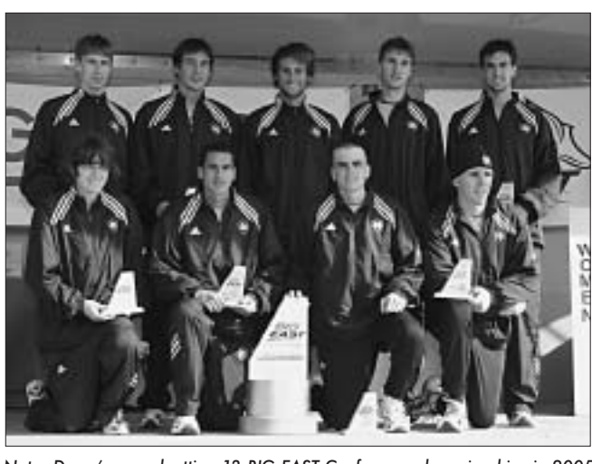
Notre Dame's record-setting 13 BIG EAST Conference championships in 2005-06 included a sweep of the men's and women's cross country titles, with the men's squad (pictured) becoming one of nine different Irish teams that have won five or more conference championships during Notre Dame's 11 years of BIG EAST membership.

Volleyball (9) 1995-1998, 2000-02, 2004, 2005