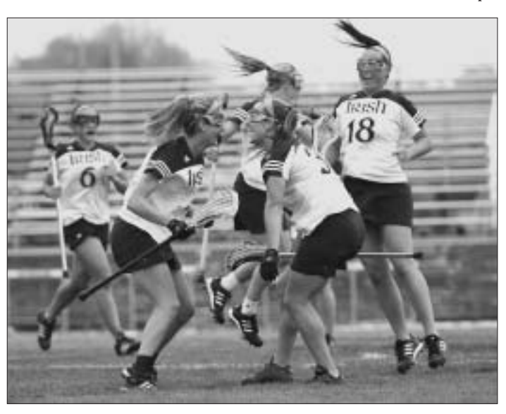
The Notre Dame athletic department's sixth-place finish in the annual Directors' Cup standings included a historic finish by the women's lacrosse team, which reached the NCAA semifinals for the first time in the program's history.