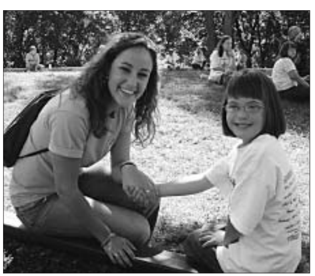
Notre Dame student-athletes annually take part in the Buddy Walk with Development area Down Syndrome children. component.

The Student Welfare and Development Program implements events and activities that are designed to facilitate learning within five key areas: academic excellence, athletic success, career preparation,