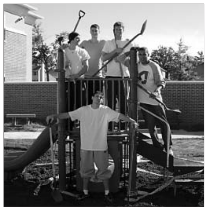
to locker rooms; the hiring of The men's basketball team assisted with building a YWCA playgound that a chiroparator; leading a benefitted 50 children and parents.

The Student Welfare and Development Program, in existence since 1996, continuously seeks to development programs that educate student-athletes on current issues – so as to ensure that when they graduate from the University, they are prepared to successfully meet the challenges of life.