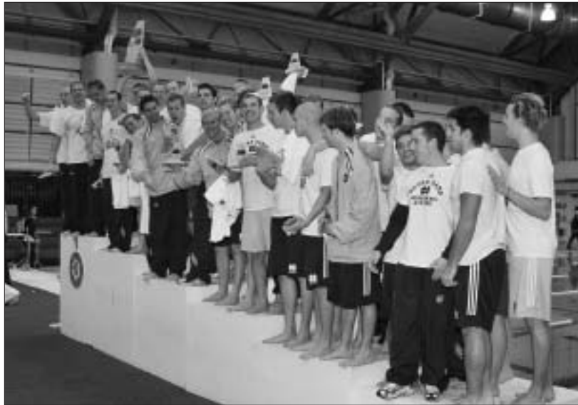
The Fighting Irish concluded the 2005-06 season just as they had the previous year, on the podium as champions of the BIG EAST Conference.

Close calls would be the story for Notre Dame's next two trips into the pool. For the second straight season the Notre Dame-University of Pittsburgh dual meet came down to the final event, the 400-yard freestyle relay. and for the second year in a row the Irish finished on top in the relay and the meet. Entering the final race, the Panthers held a 119-107 advantage but the Irish would go 1-2 and claim 15 of