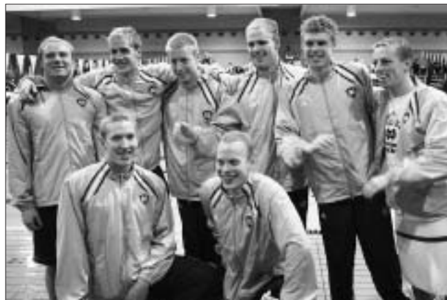
The members of Notre Dame's men's swimming and diving class of 2006 enjoyed unprecedented success for the program during their four-year run.