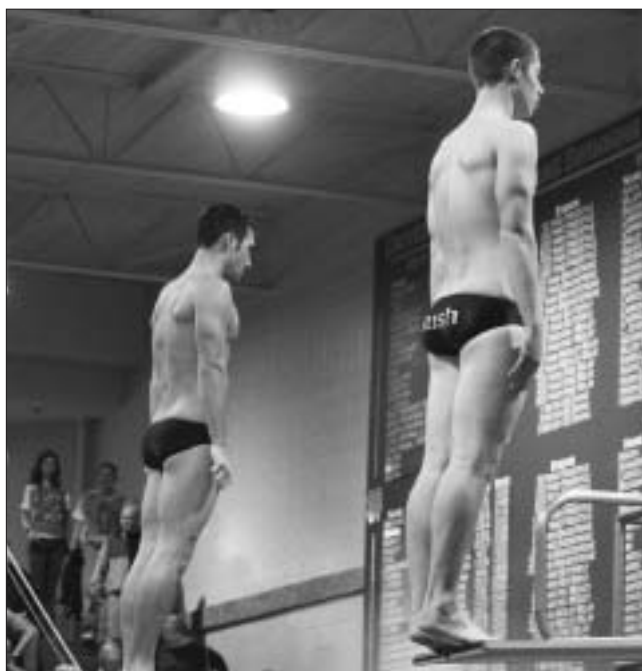
Rolfs Aquatic Center is home to Notre Dame's men's and women's swimming and diving teams. The pool has two moveable bulkheads that allow the Irish the opportunity to train on either a long or short course.

The center was officially dedicated on November 13, 1985.