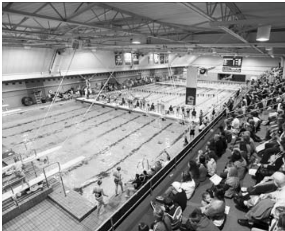
Equipment necessary for the latest training techniques, including a trampoline and underwater viewing decks, are located in the Rolfs Aquatic Center.

Support functions housed in the center of the facility just below the spectator seating include men's and women's locker rooms, men's and women's varsity locker rooms, and men's and women's staff locker rooms. Offices for the Notre Dame swimming staff, aquatics directors, and lifeguards are deckside and glass-fronted with a view of the pool.