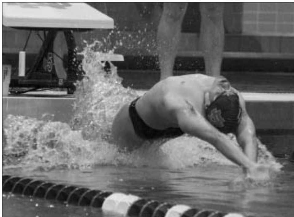
The Irish play host to six meets throughout the 2008-09 season.