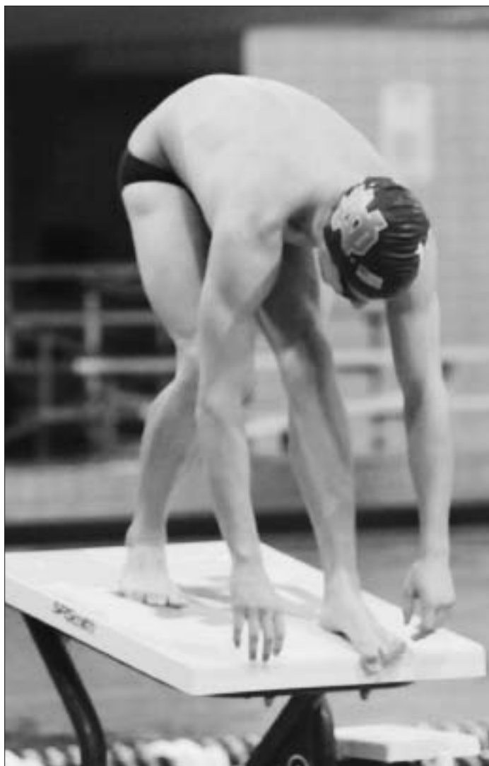
After missing out on the 2007 BIG EAST Conference title by mere points, the Irish vaulted back on top of the podium by setting six school records at the 2008 league meet.