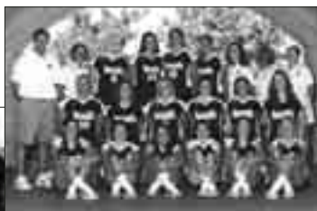
2002 BIG EAST Champions NCAA Round of 32