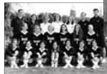
2001 BIG EAST Champions NCAA Round of 64