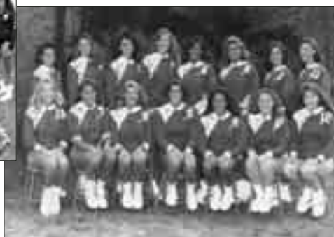
1991 NIVC Runner-Up