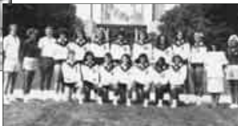
1988 NCAA Round of 16