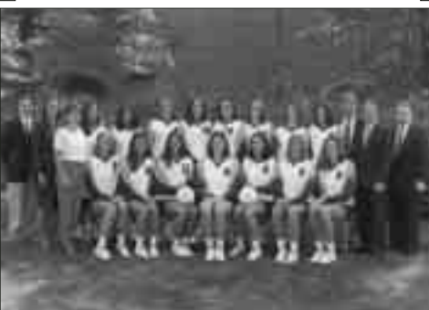
1996 BIG EAST Champions NCAA Round of 32