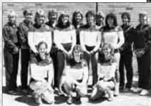
1986 North Star Champions