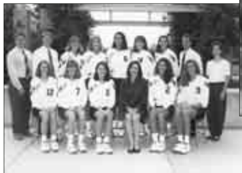
1995 BIG EAST Champions NCAA Round of 16