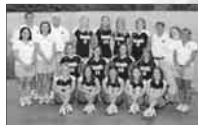
2004 BIG EAST Champions NCAA Round of 32