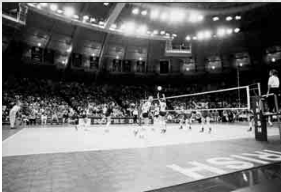
A record crowd of 8,643 witnessed the Irish outlast former league rival Virginia Tech in a five-game marathon on Nov. 7, 2003.