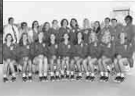
1997 BIG EAST Champions NCAA Round of 16