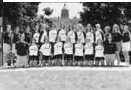
2000 BIG EAST Champions NCAA Round of 32