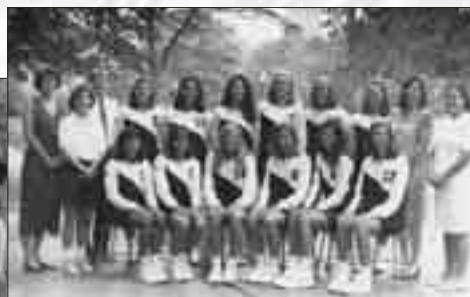
1993 MCC Champions NCAA Quarterfinals