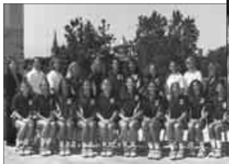
1998 BIG EAST Champions NCAA Round of 32