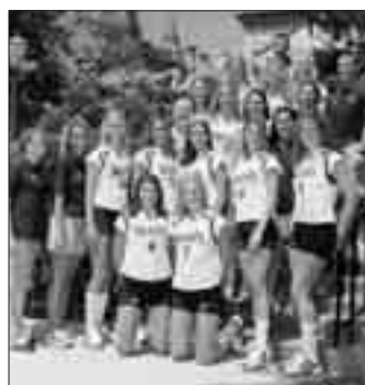
2003 BIG EAST Champions NCAA Round of 64