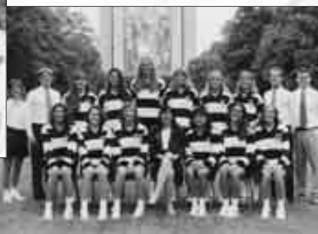
1994 MCC Champions NCAA Round of 16