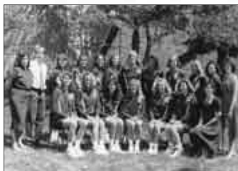
1992 MCC Champions NCAA Round of 32