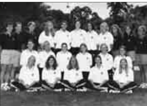
1999 BIG EAST Champions NCAA Round of 64