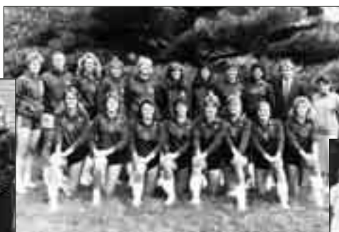
1987 North Star Champions