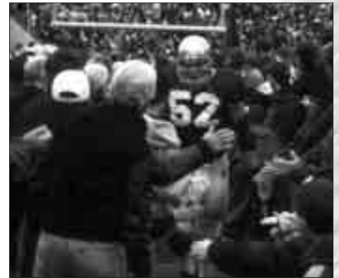
Monogram Club members annually greet the Notre Dame football team as it takes the field prior to the final home game.