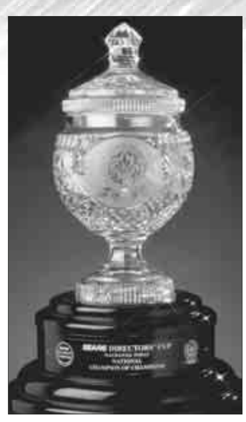
Notre Dame placed 19th in the 2003-04 NACDA Directors' Cup competition.

Winter competition meant 275 points for Notre Dame based on NCAA Championship finishes in fencing (3rd place, 85 points), women's track and field (21st, 52 points), women's swimming and diving (25th, 49 points), women's basketball (tie for 9th, 64 points, based on regional semifinal appearance) and hockey (tie for 9th, 25 points, based on regional semifinal appearance).