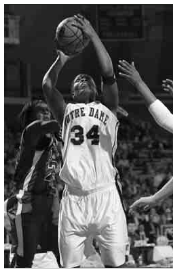
Notre Dame will play host to Purdue in the second BIG EAST/Big Ten Challenge before an ESPN2 national television audience on Jan. 16 at the Joyce Center.