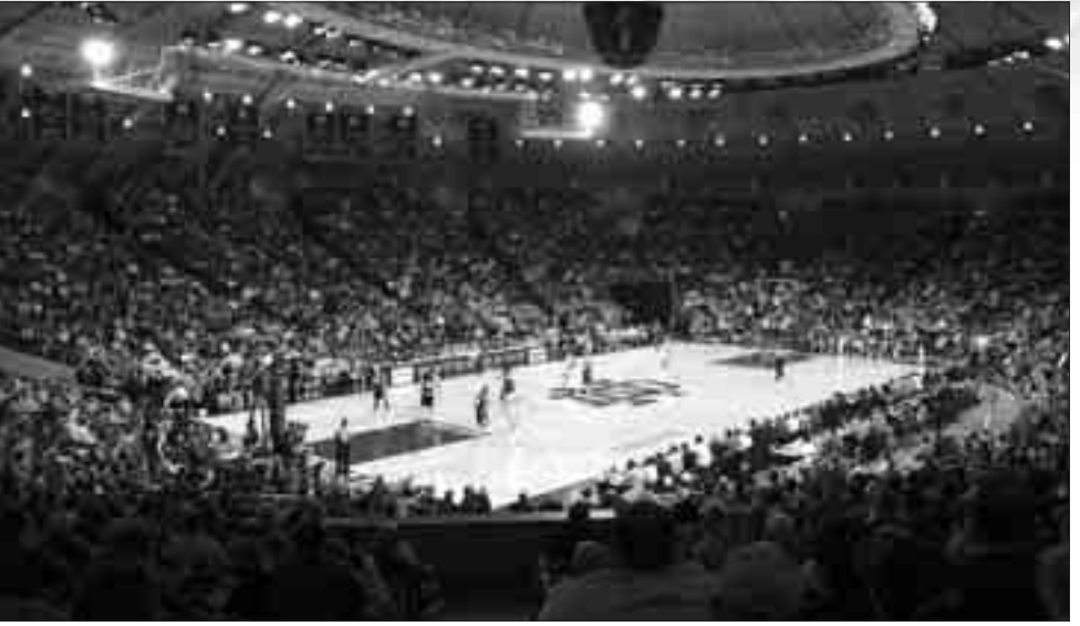
Notre Dame has ranked in the Top 10 in the nation in attendance each of the last three seasons. In 2002-03, the Irish drew 9,483 fans to the Joyce Center for their matchup with Purdue.

NCAA Women's Final Four Indianapolis, Ind. RCA Dome (Capacity 28,937) Butler University - co-host Horizon League - co-host