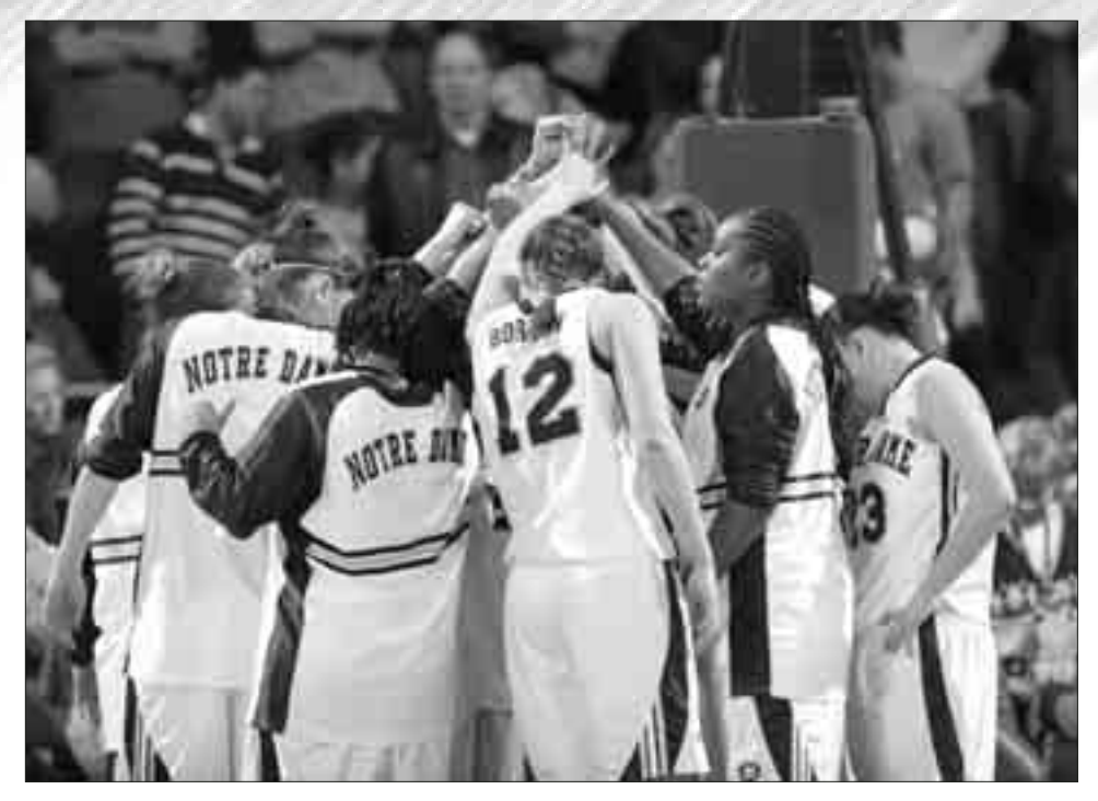
Notre Dame plays five of its final seven games on the road, ending with a trip to Seton Hall on March 1.