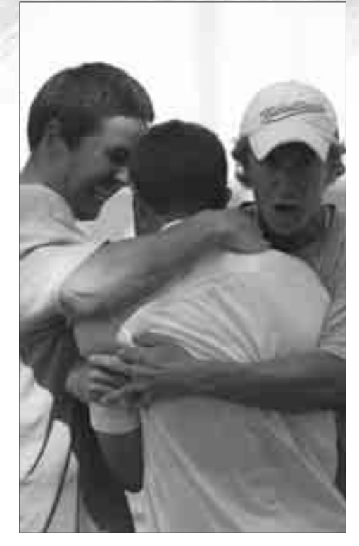
The Notre Dame men's tennis team celebrated its fourth BIG EAST title in 2004.

In the spring of 2001, the BIG EAST added