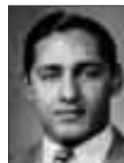
Jose Napoleon Duarte