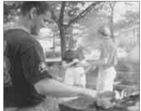
Dorms and organizations hold game-day barbecues on the quad.