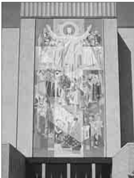
The Theodore M. Hesburgh Library and the nine other libraries on campus contain a total of more than three million volumes.