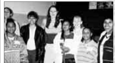
Women's basketball player Ruth Riley was the 2001 winner of the Christopher Zorich Award, which recognizes the contributions of a Notre Dame student-athlete to the community.