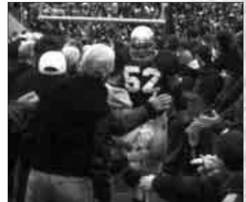
Monogram Club members annually greet the Notre Dame football team as it takes the field prior to the final home game.

• Honorary monograms also are awarded on an annual basis to a select group of individuals who have demonstrated exceptional service to Notre Dame. The Monogram Club's highest honor — The Moose Krause Award — is bestowed upon active Monogram Club members in recognition of distinguished service.