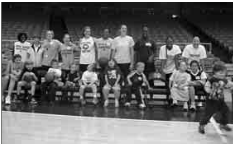
The women's basketball team finds loads of laughter in an attempt to take a group picture during their Court Fun Day with children from the Michiana Downs' Syndrome Society.