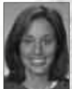
Kate Sobrero Markgraf