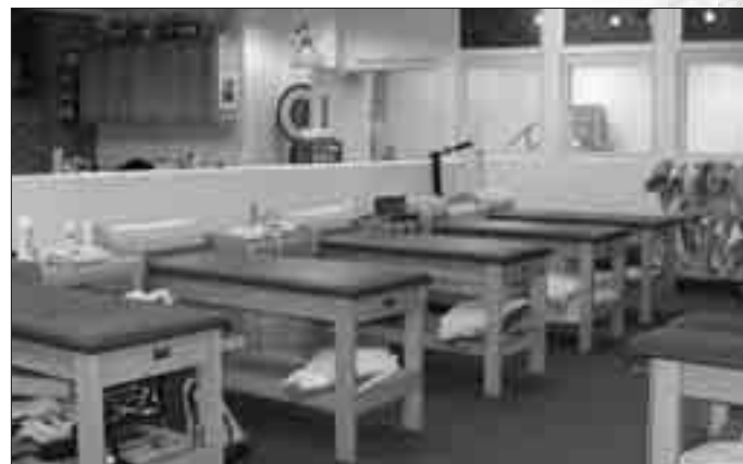
Irish athletics receive the finest in sports medicine care from the team of athletic trainers and physicians. The latest in sports medicine technology is located in the 3,300-square foot athletic training facility located in Notre Dame Stadium.

The sports medicine team of athletic trainers and team physicians is committed to providing the most comprehensive and safest health care possible. Evaluations, treatments and rehabilitation are established for each individual, taking into consideration the sport in which the athlete participates, as well as other intangible matters. The primary goal of the Notre Dame sports medicine department is to return the athletes to their status before injury in the safest and quickest manner possible.