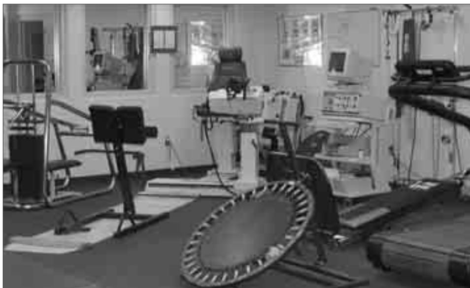
The entire athletic training staff at Notre Dame is certified by the National Athletic Trainers' Association and has collectively more than 150 years of experience.