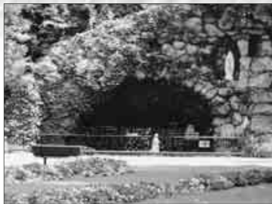
Notre Dame celebrated the centennial of The Grotto in 1996.