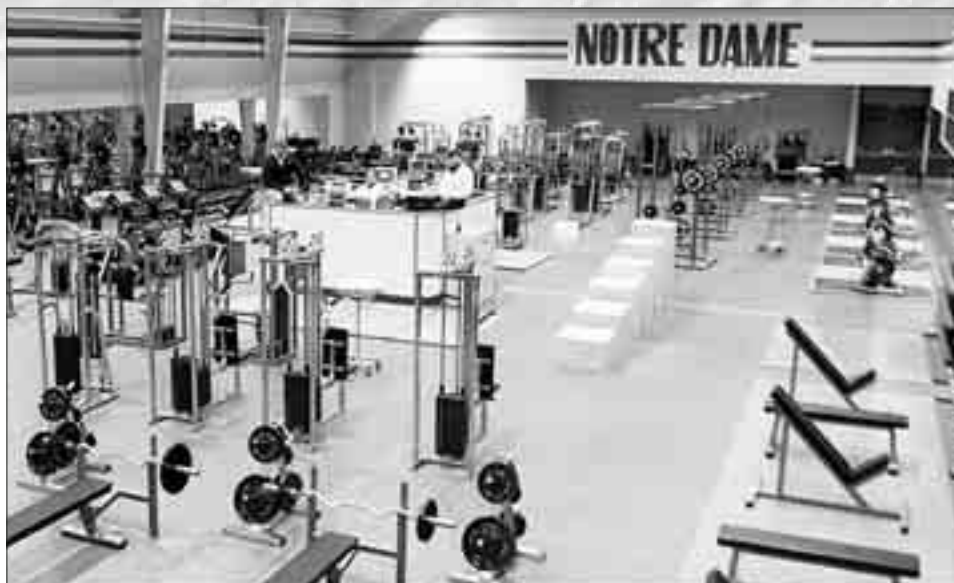
The Notre Dame weight room is one of the finest facilities of its kind in college athletics.

All programs are evaluated daily and each individual's progress is charted and monitored with the aid of computer technology. While the student-athlete's physical progress is gauged through a battery of testing procedures, the strength and conditioning staff also helps each individual set training goals that strive for complete excellence.