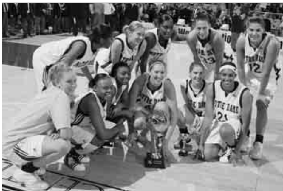
Sparked by their run to the Preseason WNIT title, the Irish opened the 2004-05 season with a 7-0 record and rose to No. 3 in the national polls.

Three nights later in the Preseason WNIT cham-