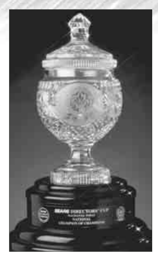
Notre Dame placed 16th in the 2004-05 NACDA Directors' Cup competition.