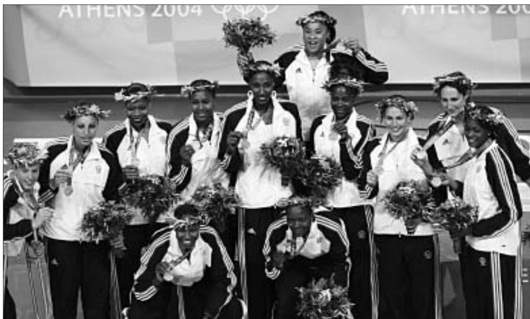
Former Notre Dame All-American Ruth Riley (second from right) and her U.S. Olympic teammates celebrate their gold medal at the 2004 Athens Games.

Riley was the team's second leading scorer (10.3 ppg.) and top rebounder (7.5 rpg.). She recorded two double-double performances as the Irish went 3-0 against Puerto Rico to open the tour. She had 12 points and 11 rebounds in the opening game,