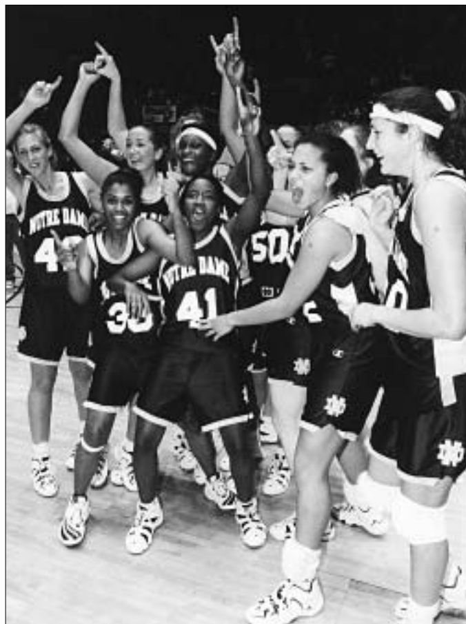
Notre Dame's second-round upset of top-seeded Texas Tech in Lubbock, Texas, in 1998 produced an exhilarating moment for Irish players.

The Irish closed out their season with a 22-10 record, its fifth consecutive 20-win campaign, and finished 17th in the final USA Today /ESPN Coaches Poll.