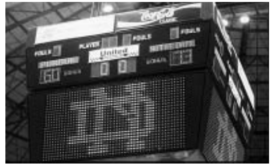
Notre Dame's 73-60 victory over Purdue in 1996 marked the first NCAA Tournament win ever for the Irish.