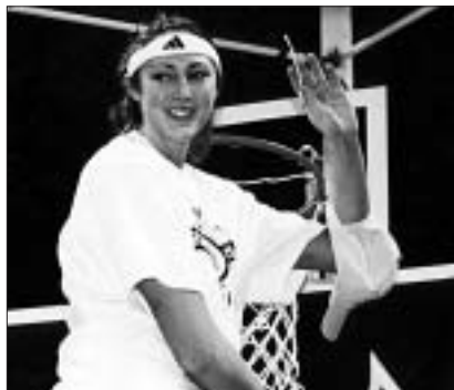
Ruth Riley cuts down the nets at the Savvis Center after Notre Dame claimed its first NCAA title with a 68-66 win over Purdue on April 1, 2001. Riley was named the Final Four's Most Outstanding Player after collecting 28 points, 13 rebounds and seven blocked shots in the championship game against the Boilermakers.