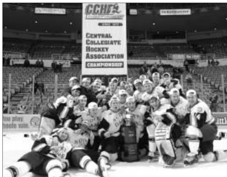
The Notre Dame hockey team won its first-ever CCHA regular-season and postseason tournament titles during 2006-07. The Irish (32-7-3) were ranked number one in the country for seven straight weeks from Feb. 5 through March 23.