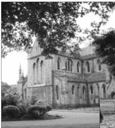
While in Dublin, the team toured historic St. Patrick's Cathedral.

We woke up early to make the long trip home. What I learned on this trip is of different cultures and their pride, patriotism and loyalty, and that, however different, we are each proud of our own homeland and that is what makes each so special. That the Irish are proud to be Irish, the English proud to be English, and I and my teammates are proud to be American, hailing from the "land of the free and the home of the brave."