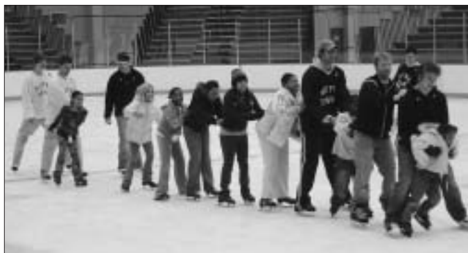
The Notre Dame hockey team annually holds a special skate day with children from the South Bend community.