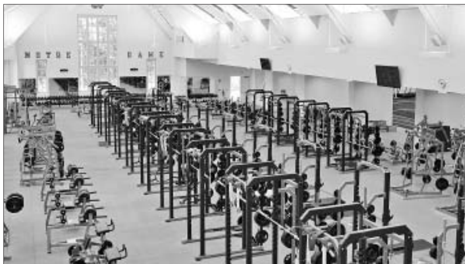
The Haggar Fitness Center, which is shared by both the Loftus Center and the Guglielmino Athletics Complex, features 25,000 square feet of strength and conditioning space with state-of-the-art weight equipment, a 50-yard Mondo track for speed training, a 45-yard by 18-yard Prestige Turf athletic surface for team workouts and an updated sound and lighting system that features six plasma television screens.