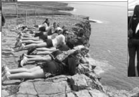
Don't look down. Members of the Irish women's lacrosse team at the edge of the Cliffs of Moher.