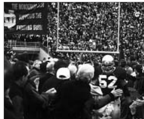
Monogram Club dues-paying members annually greet the Notre Dame football team as it takes the field prior to the final home game.

• A series of football-weekend receptions for Monogram Club members and their guests, typically held in the Joyce Center prior to each home football game (the final home game also traditionally includes a unique thrill for all former mono-