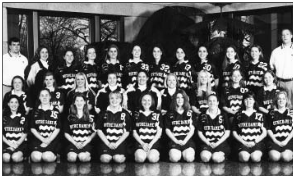
Notre Dame's First Varsity Women's Lacrosse Team (1997)