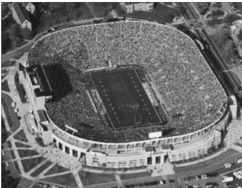
Notre Dame will play host to the 2008 BIG EAST Women's Lacrosse Championships on April 25 and 27. The semifinals and finals will be played at historic Notre Dame Stadium.