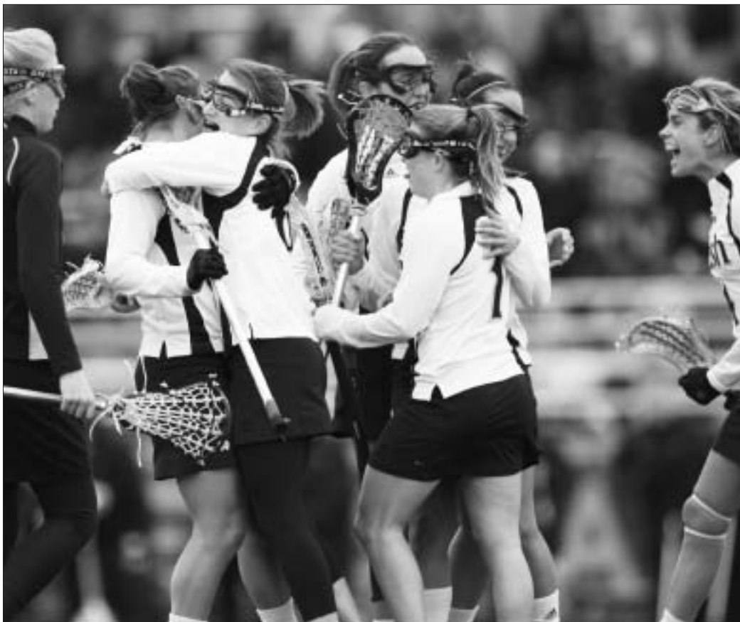
The Irish celebrate a goal in the 13-8 win over Georgetown on April 14. The loss, the first ever suffered by the Hoyas in BIG EAST regular-season play, snapped a 37-game conference winning streak.