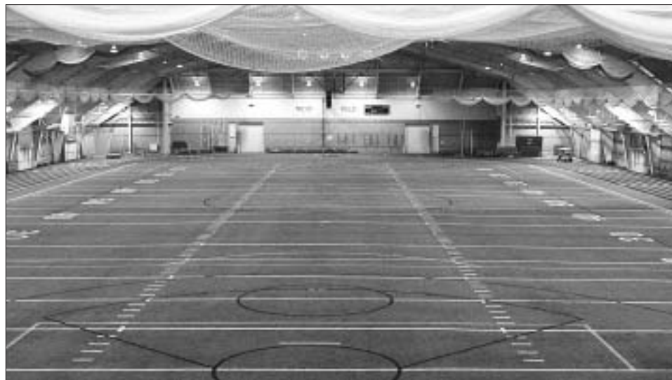
The Loftus Sports Center, one of the six indoor facilities in the country that plays host to Division I women's lacrosse games, is the home of the Notre Dame Fighting Irish women's games when inclement weather precludes them from being contested at Moose Krause Stadium.