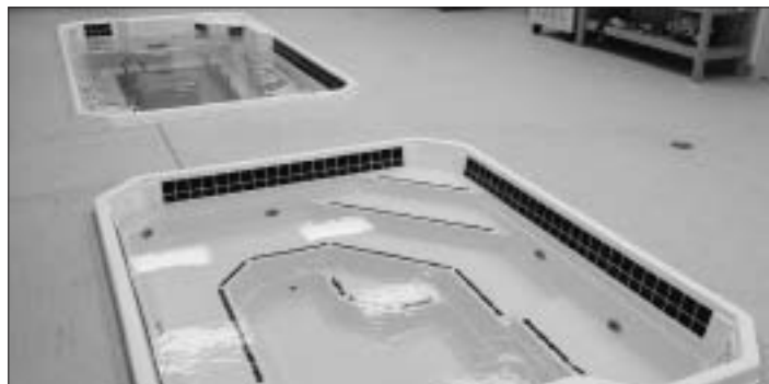
The Notre Dame athletic training staff has access to two whirlpool rehabilitation stations in the Guglielmino Athletics Complex.