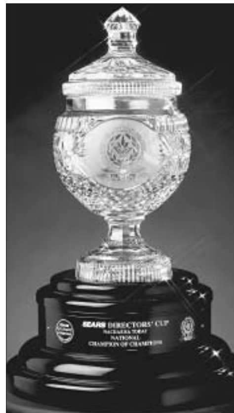
Notre Dame placed 22nd in the 2006-07 NACDA Directors' Cup competition, marking its ninth straight top-25 finish in the annual all-sports rankings.

The Directors' Cup competition honors institutions for maintaining athletic programs that seek to achieve success in many sports, both men's and women's. Begun in 1993-94 for Division I by NACDA and USA Today , the program was expanded in 1995-96 to include Divisions II, III, and the NAIA. The scoring format – which has undergone yearly minor adjustments – awards the overall champion to institutions that records the highest number of points in their division's Directors' Cup standings.