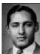
Jose Napoleon Duarte