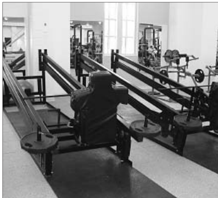
One of the eye-catching features of the Haggar Fitness Complex, a 25,000 square-foot facility shared by the Guglielmino Athletics Complex and the Loftus Center, is the inclusion of two variable weight sleds that were installed in the summer of 2005.