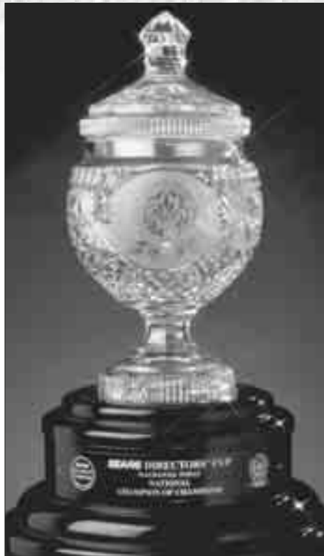
Notre Dame placed 16th in the 2004-05 NACDA Directors' Cup competition.