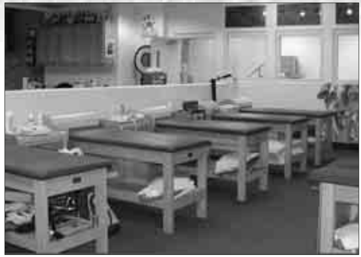
Irish athletics receive the finest in sports medicine care from the team of athletic trainers and physicians.

The Notre Dame student-athlete has access to three state-of-the-art sports-medicine facilities, in addition to the 24-hour University Health Center. The original athletic-training room is located in the Joyce Center. Notre Dame Football Stadium is home to the 3,300-square-foot athletic training room, and the newest addition to the sports-medicine department is located in the new Guglielmino Athletics Center. The facility opened in August of 2005 and is more than 8,500 square feet of cutting-edge sports-medicine technology. Through these facilities all student-athletes have access to the most-modern sports medicine, including the latest in physical therapy modalities and rehabilitation equipment, which includes two 3,500-gallon therapy pools. A full x-ray unit and an MRI machine make up the majority of the department's diagnostic equipment.