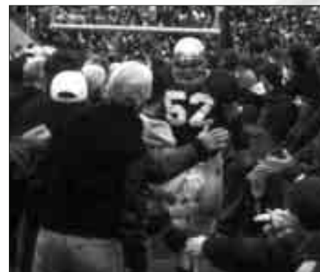
Monogram Club members annually greet the Notre Dame football team as it takes the field prior to the final home game.

• The organization of several popular events, including the third annual Football Fantasy Camp, the second Adult Tennis Camp and the annual Monogram Club golf outing (held during reunion weekend)