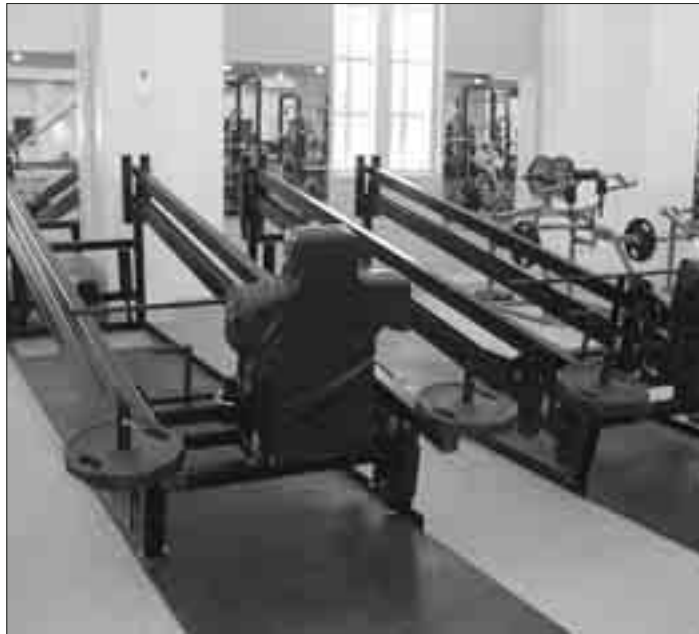
One of the eye-catching features of the Haggar Fitness Complex, a 25,000 square foot facility shared by the Guglielmino Athletics Complex and the Loftus Center, are two variable weight sleds installed in the summer of 2005.

When entering the Haggar Fitness Complex (shared by the Loftus Sports Center and the Guglielmino Athletics Complex) student-athletes are quickly reminded of the "roll-up-your-sleeves" and "get-to-work" mentality that Mendoza and his staff inspires.