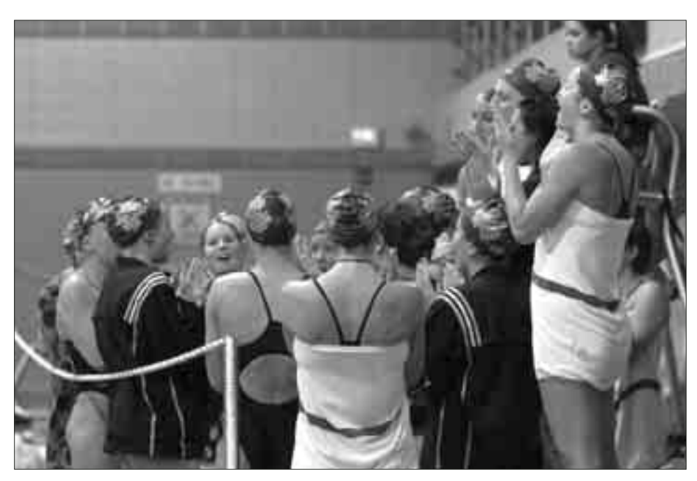
The 2004-05 team saw three school records fall during the season, including the 800 freestyle relay record at the BIG EAST Championships.